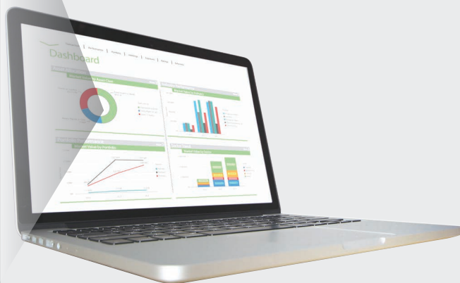
The dashboard shows essential data from multiple applications, all in one place.

The FRAS solution is easy to use. UBTI sets it up by integrating separate systems such as CRM, trading, and accounting, to name a few. The firm's users are then assigned specific levels of access rights depending on their role. The users can now view essential data from numerous systems all in one place, bringing efficiency and clarity to the decision-making process.